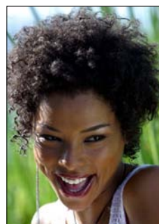
Sophie Okonedo ( U.K. ) as mrs. DAKTIAR "Hotel Rwanda"